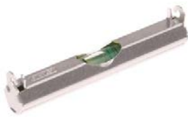
80MM LINE LEVEL STANLEY