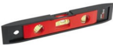
230MM BOAT LEVEL WITH MAGNETIC BASE