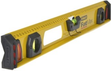
1.2M LEVEL—FAT MAX STALEY