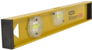
36" POLYCAST GIRDER LEVEL